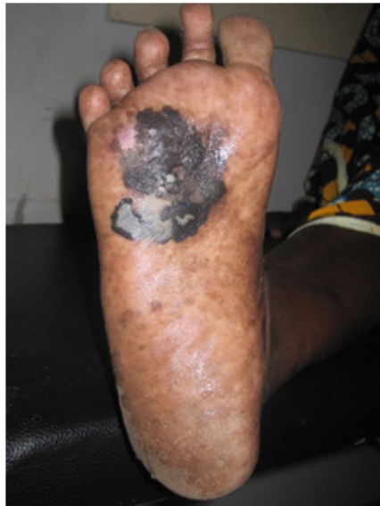
Figure 1: Plantar melanoma